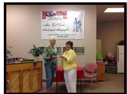
Hidden Treasures Donation

We thank Hidden Treasures and their founding Lutheran Churches. Their generous donation will be enriching our Scholarship Program, allowing us to offer our Caregivers a free session for their Loved Ones as they attend a "Caregiver Roundtable".....a time for fellowship,